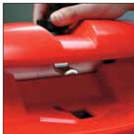
6. Close lid and activate the lock.