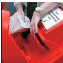
2. Lift and push the towel ballast plate back up into the body.