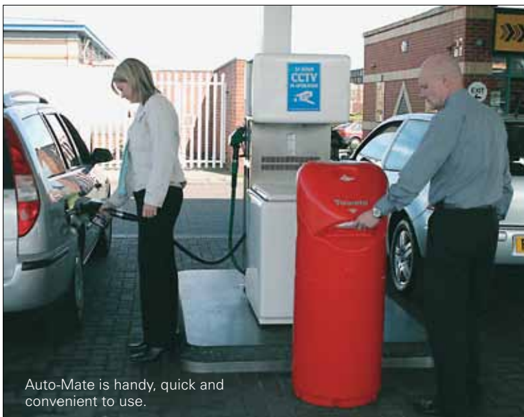
Auto-Mate is handy, quick and convenient to use.