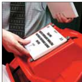
5. Refill with new glove pack.