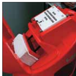
3. Refill with new towels.