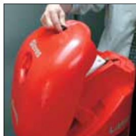
1. Unlock the cover and lift the lid to reveal the interior.