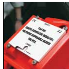
4. Remove the empty glove box.