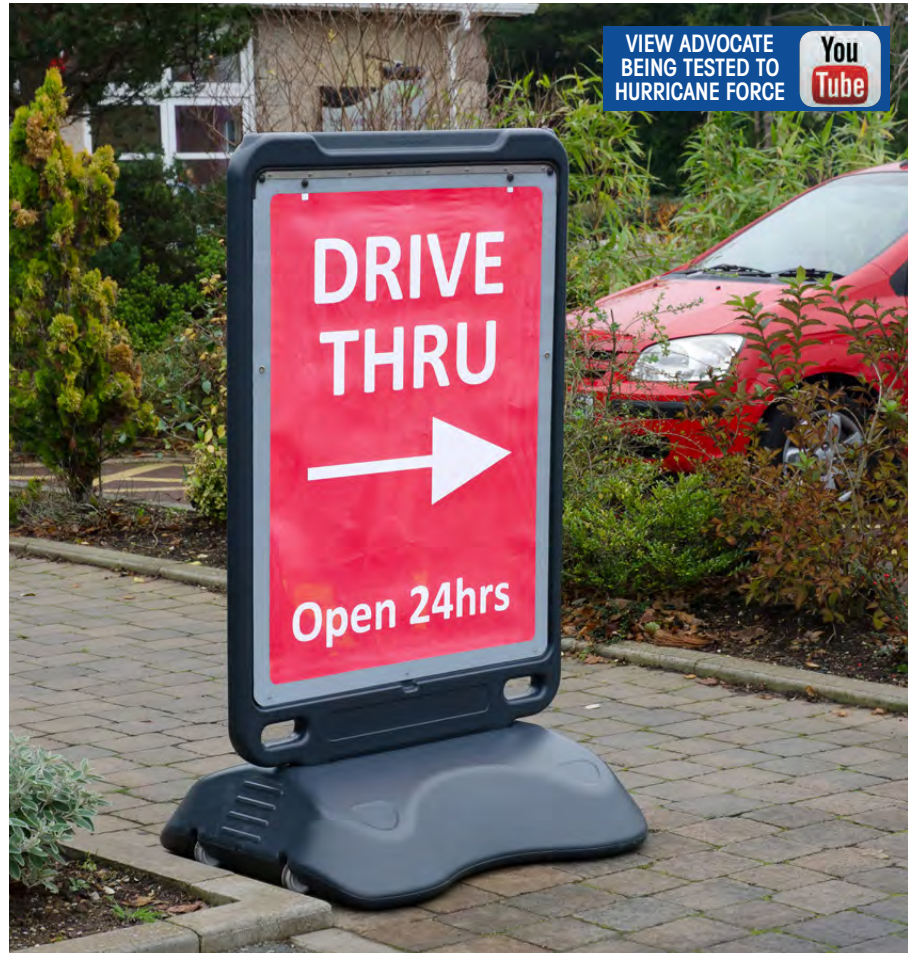
1. Advocate™ Poster Display Sign