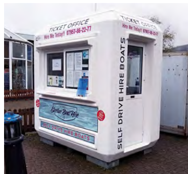
Genesis Kiosk 2.3 x 1.5 Model