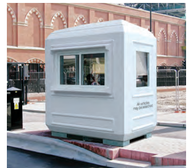
Genesis Kiosk 2.3 x 1.5 Model