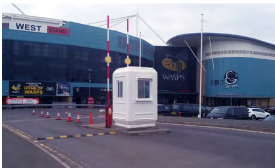
Genesis Kiosk 1.5 x 1.5 Model