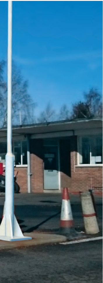
Genesis Kiosk 2.3 x 1.5 Model