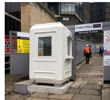
Genesis Kiosk 1.5 x 1.5 Model