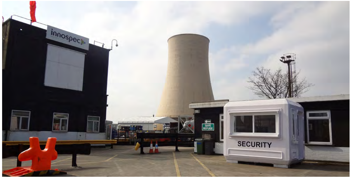
Genesis Kiosk 2.7 x 2.2 Model