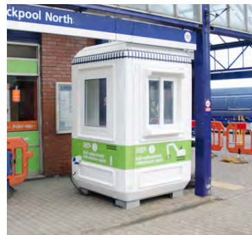
Genesis Kiosk 1.5 x 1.5 Model