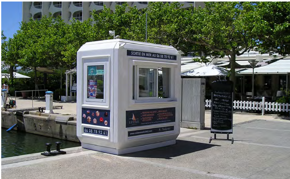
Genesis Kiosk 2.3 x 1.5 Model

*NOTE: For 1.5 x 1.5m and 2.3 x 1.5m Models a forklift truck with 1200mm long forks (minimum) is required for customer off-loading. If you do not have access to a forklift truck, then please advise us at your time of order, so that we can arrange delivery using a crane-equipped vehicle. The 2.7 x 2.2m Model will always be delivered using a crane-equipped vehicle.