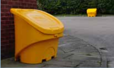
Nestor™ 400 Grit Bin

Glasdon can provide you with the right tools for keeping your staff and visitors safe during the winter months. We offer a range of high quality grit bins, towable and manual grit/salt spreaders and snow removal equipment.