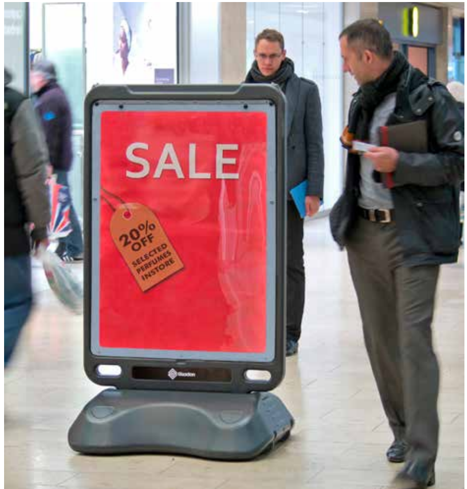
1. Advocate Poster Display Sign