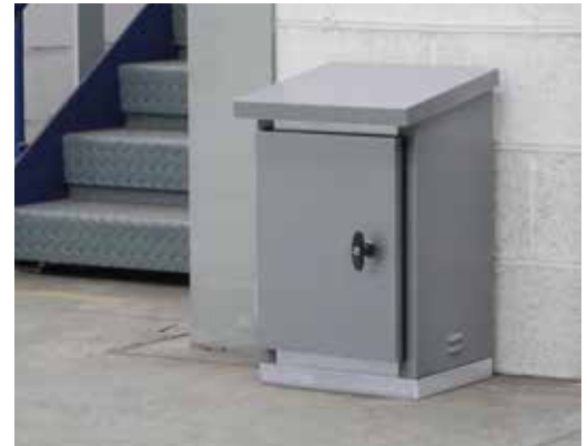
1. Citadel Cabinet

The Citadel™ range offers a cost-effective solution to the secure housing of equipment for a variety of applications. Available in five industry standard sizes, the cabinets can be supplied with ventilation or without for IP56 rated protection.