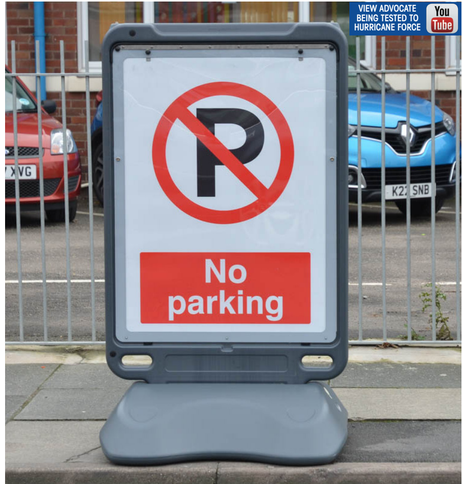
1. Advocate Poster Display Sign