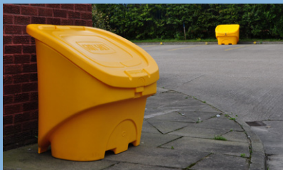
Nestor™ 400 Grit Bin

Glasdon can provide you with the right tools for keeping your staff and visitors safe during the winter months. We offer a range of high quality grit bins, towable and manual grit/salt spreaders and snow removal equipment.