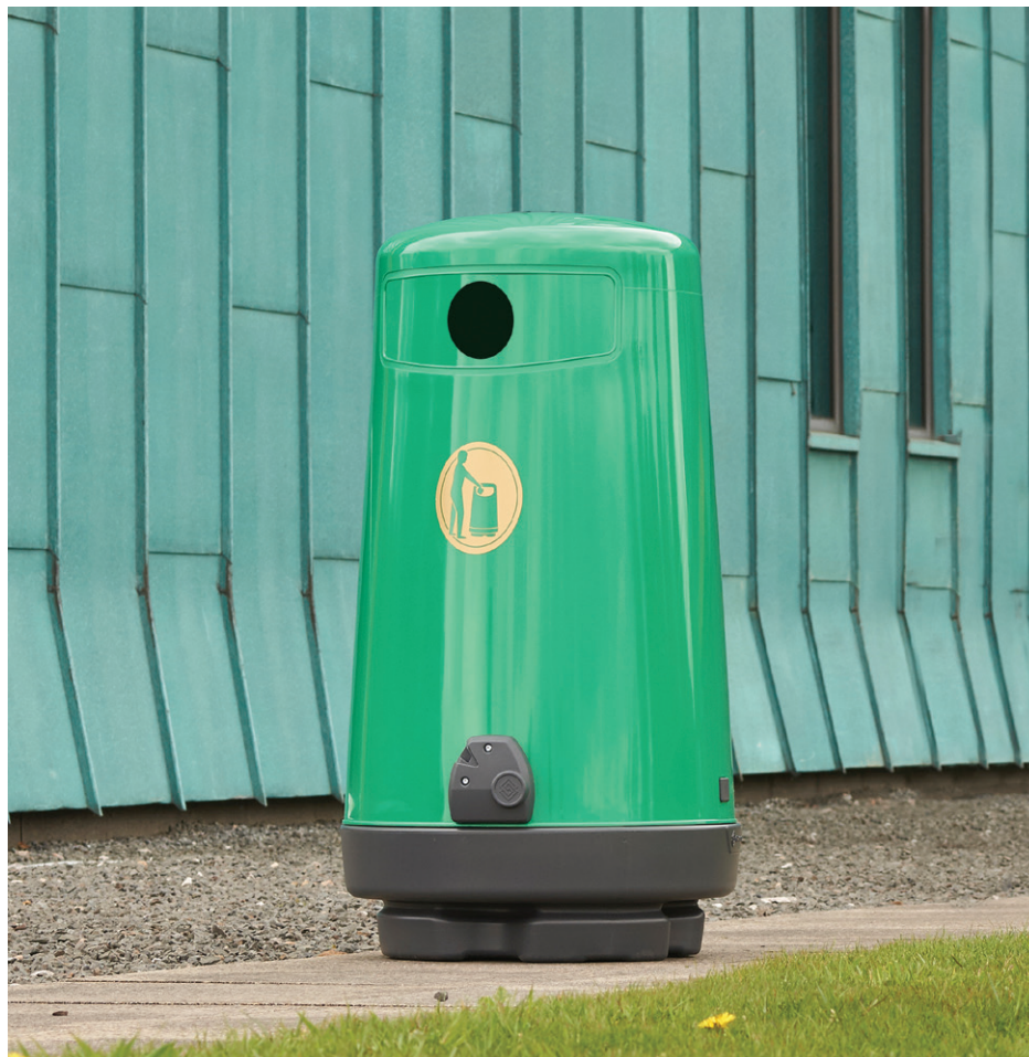
1. Topsy 2000™ Litter Bin

Smart waste technology available on a selection of our products. Please see back page for further information.