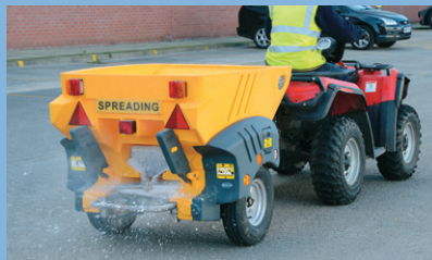
Turbocast 800™ Towable Grit/Salt Spreader