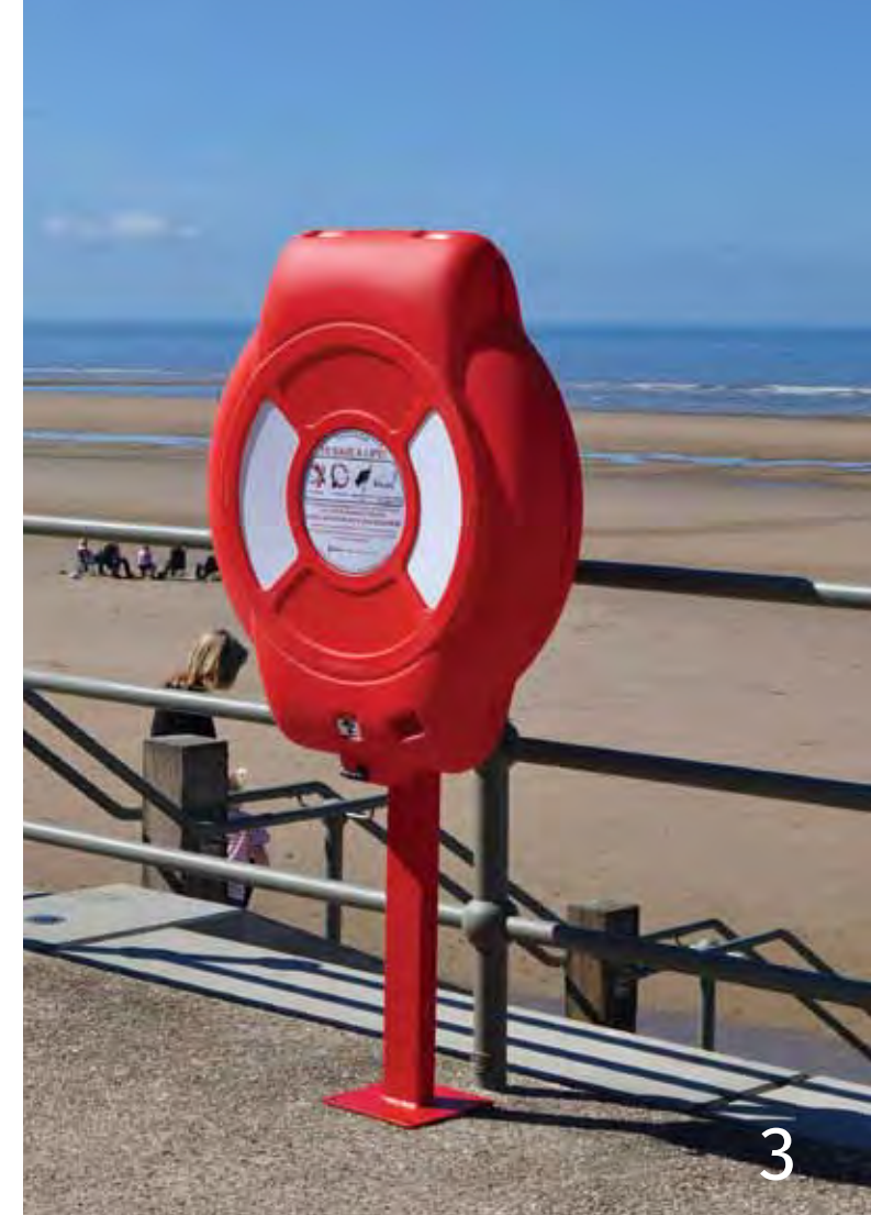
GUARDIAN 600 Housing Holds two B-Line Water Rescue Devices OR one 600mm Lifebuoy.