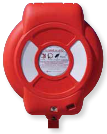
GUARDIAN 750 Housing Holds two B-Line" Water Rescue Devices OR one Lifebuoy (750mm or 600mm).