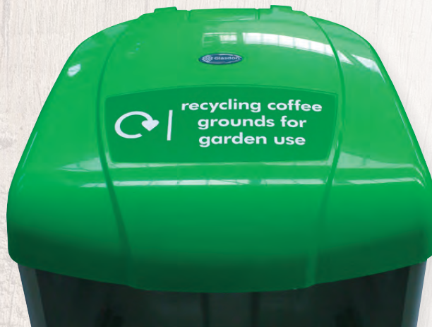
1. Nexus® Shuttle Food Waste Bin