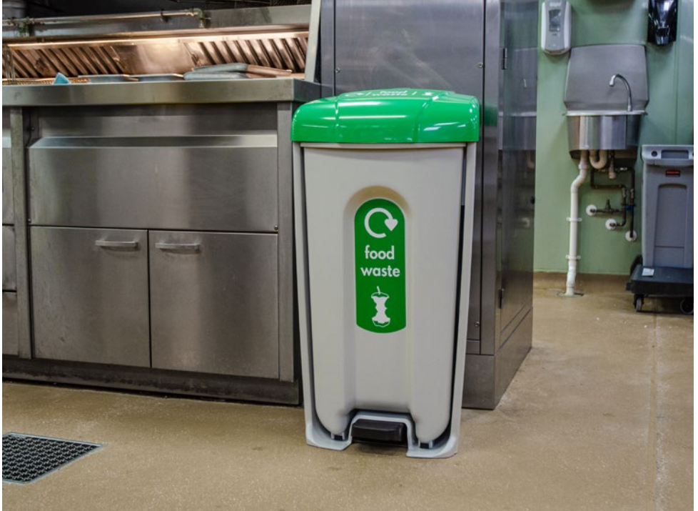
Nexus® Shuttle Food Waste Bin

Our food waste recycling bins are ideal for kitchens, canteens, food courts and any other areas where food is prepared or consumed. The easy to use foot pedals and large apertures make food waste disposal effortless and hygienic.