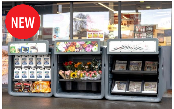
NEW Nova™ Storage Bunker