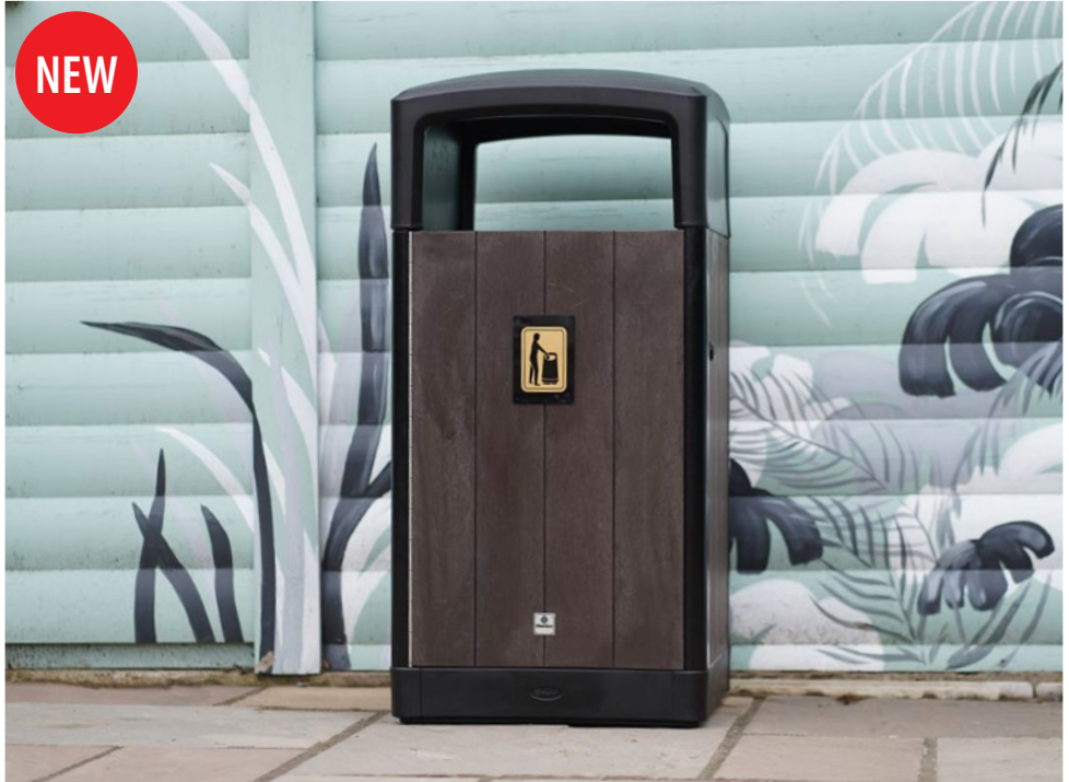
NEW Origin™ Curve 110 Litter Bin

We recognise that waste management requirements may completely differ from one organisation or setting to another. That's why we supply a variety of litter bins that will suit all styles, budgets and requirements. All of our litter bins are easy to clean and never need painting, giving you an attractive and highly functional waste container for many years.