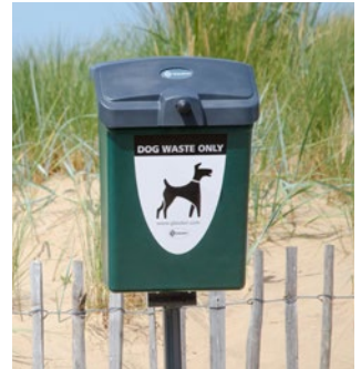
Fido 25™ Dog Waste Bin