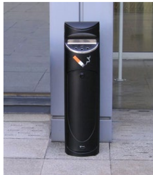
Ashguard SG™ Cigarette Bin