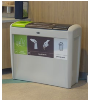
Nexus® Evolution Cup Recycling Station