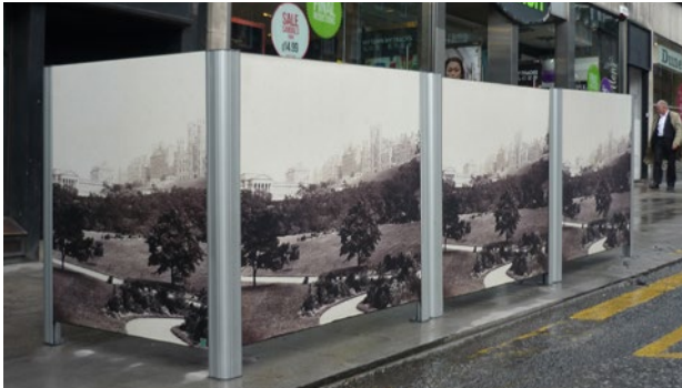
Visage™ Screen System