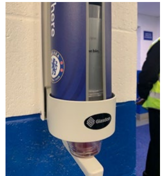
Nexus® Cup Stacker