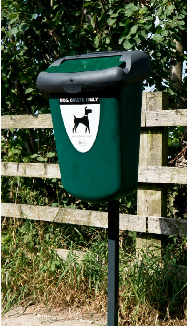
Retriever 35™ Dog Waste Bin

To help keep pavements and open spaces clear of dog fouling, we produce a range of dog waste bins that are extremely strong and durable. Designed to be wall- or post-mounted, these dog waste bins will encourage owners to tidy up after their dogs, keeping areas clean and tidy.