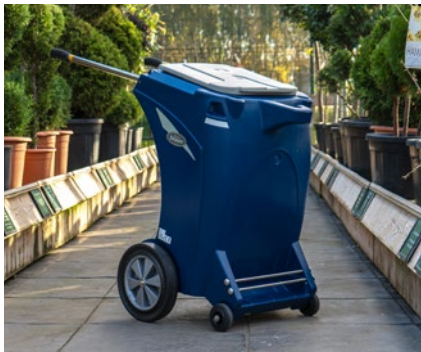
Skipper™ Multi-Purpose Cleaning Trolley