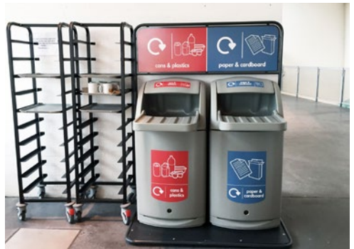
Combo™ Tray Shelf Catering Waste Bin