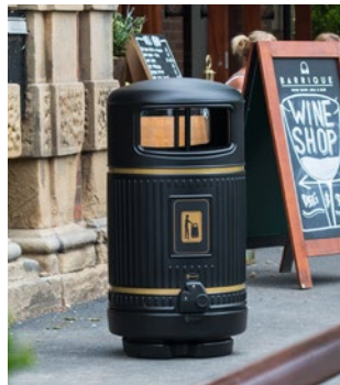
Topsy Royale™ Litter Bin