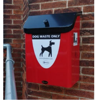
Metal Fido 35™ Dog Waste Bin