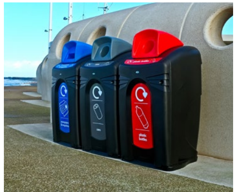
Nexus® City 240 Recycling Bin