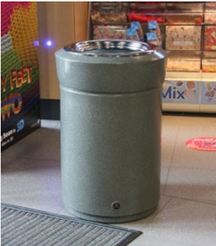
Statesman™ Litter Bin