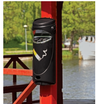
Ashmount SG™ Cigarette Bin