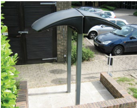
Eclipse™ Back-to-Back Canopy