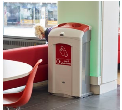
Nexus® 100 Recycling Bin