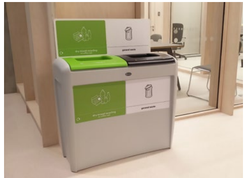
Nexus® Evolution Duo Recycling Bin