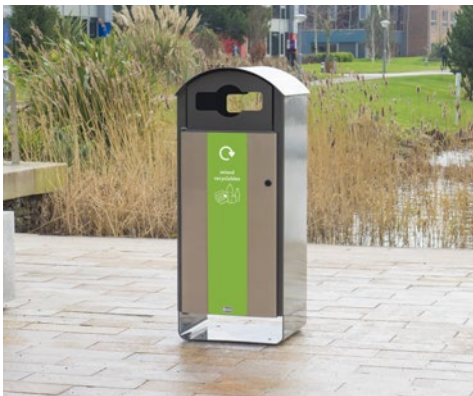
Electra™ Curve 85 Recycling Bin