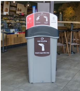
Eco Nexus® Cup Recycling Station