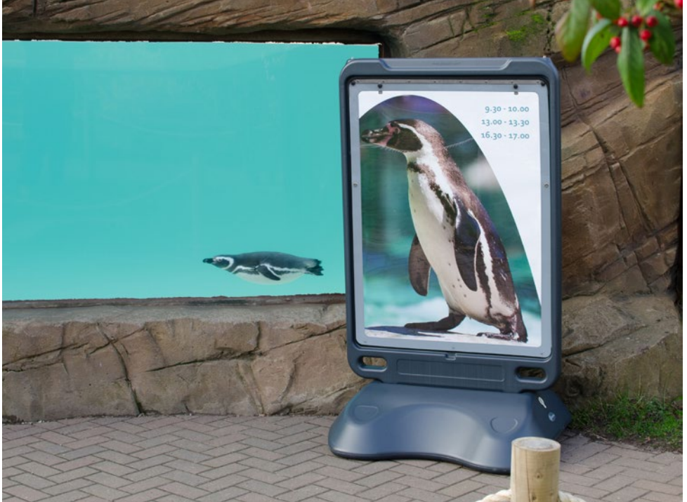
Advocate™ Poster Display Sign

Great for leisure facilities, these site sign carriers and storage bunkers are the ideal way to promote your brand. The Everwood™ material of Glasdon Gateway will not warp or rust and the poster display sign can be easily cleaned. The Nova™ Storage Bunker is designed to offer a large storage capacity and customisable shelving, providing optimal display space.