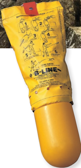
B-Line™ Water Rescue Device