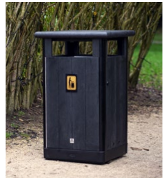
NEW Origin™ Horizon 110 Litter Bin