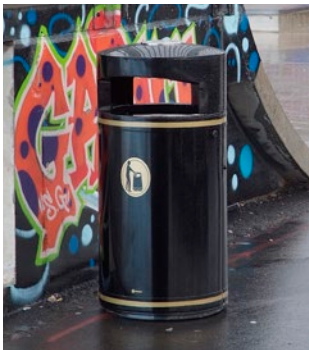
Metal Chieftain™ Litter Bin