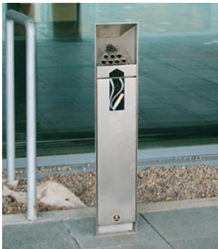
Ashguard™ Cigarette Bin