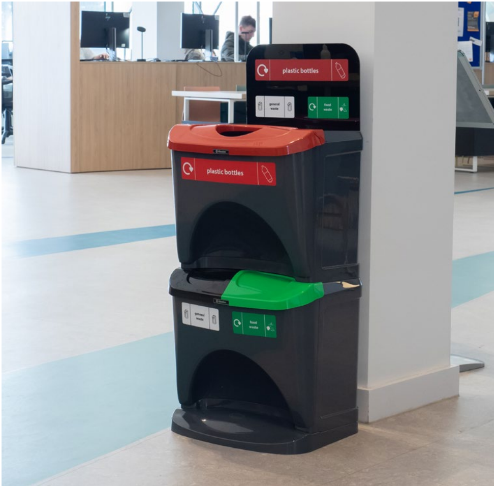
Nexus® Stack Recycling Bin