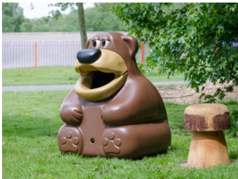
TidyBear™ Litter Bin