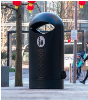
Elipsa™ Litter Bin