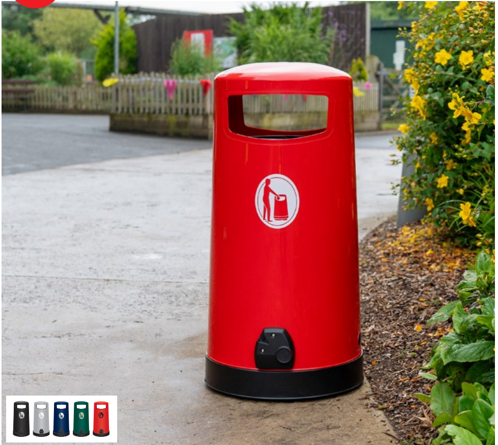
NEW Topsy™65 Litter Bin