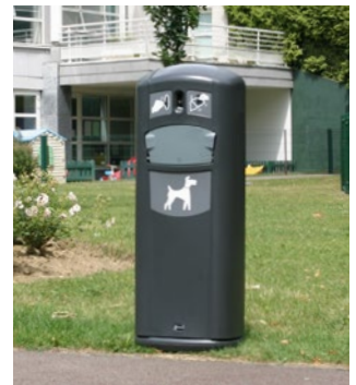
Retriever City™ Dog Waste Bin

Read our FAQ on the website about how to choose a dog waste bin.