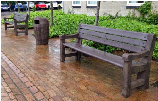
Elwood™ Seat and Sherwood™ Hooded Litter Bin