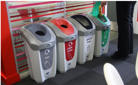
Nexus® 30 Recycling Bin