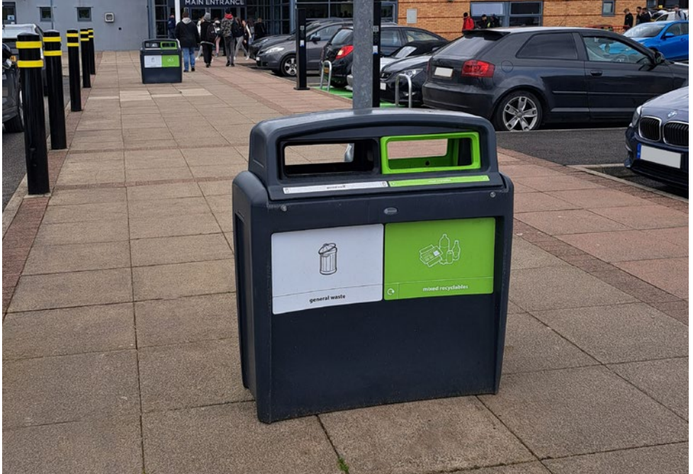
Nexus® Evolution City Duo Recycling Bin

We produce an extensive range of outdoor recycling bins of the highest quality in both traditional and contemporary designs. All of our recycling containers are designed to be hard-wearing and long-lasting and feature easily identifiable graphics to make recycling easy.