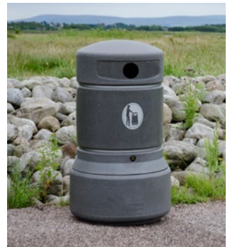
Plaza® Litter Bin