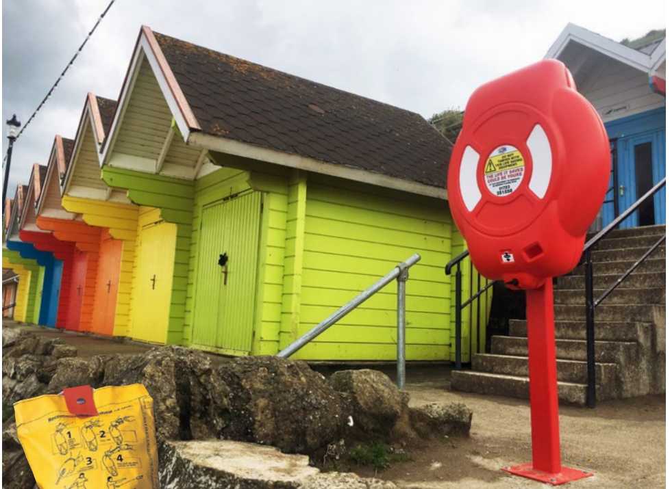
Guardian™ Lifebuoy Housing

Glasdon is a market leader in the manufacture and supply of life-saving water safety equipment. The range includes 24" and 30" lifebuoys with 30m and 50m throwing ropes, lifebuoy housing units, the B-Line™ throw line rescue buoy, and equipment storage units.