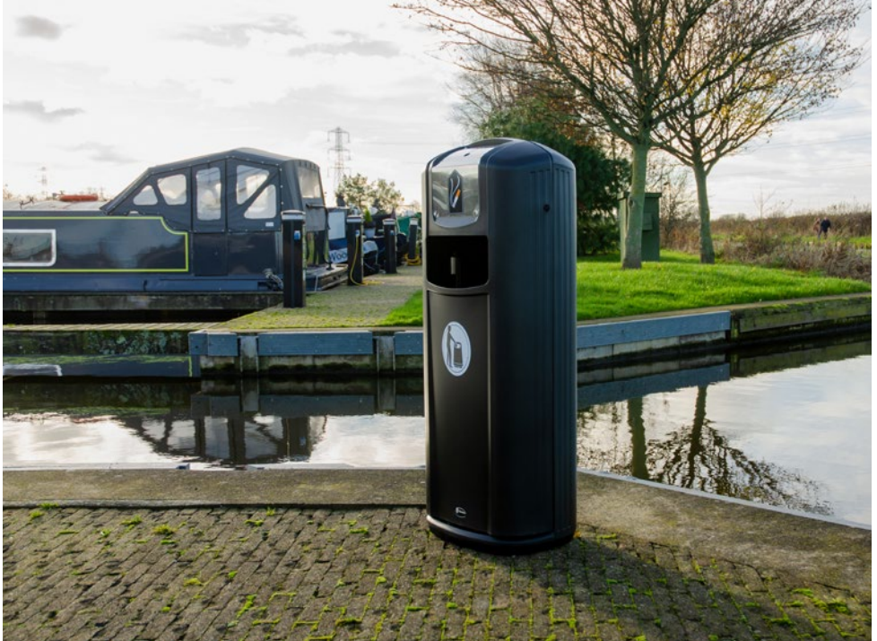
Integro City™ Cigarette & Litter Bin

We're here to help you keep cigarette waste under control on your premises with a wide range of quality, hard-wearing smoking bins. The Glasdon collection offers everything from free-standing ashtrays and cigarette bins to wall-mounted ashtrays.