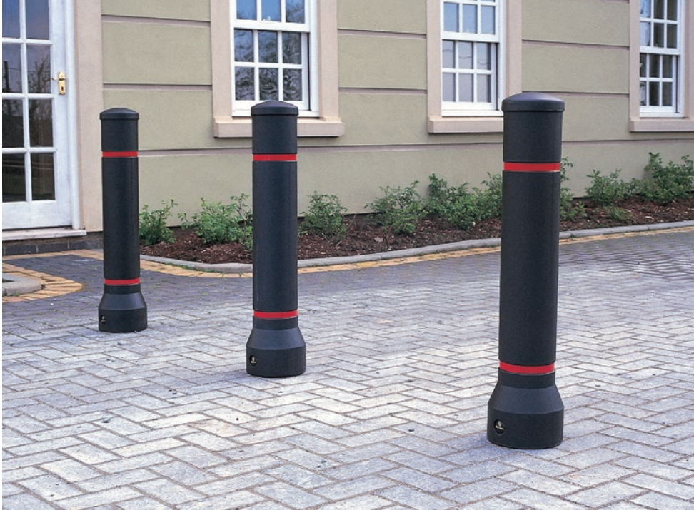
Neopolitan™ 20 Bollard

Our Bollards and Posts are available in a variety of traditional or modern styles and can be used for access control, verge protection and delineators to identify parking restrictions.