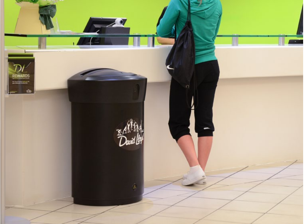
Envoy™ Litter Bin

We produce an extensive range of indoor litter bins made from highly durable materials to ensure a functional and long service life. Our collection of contemporary internal litter bins are stylish and will complement their surroundings.