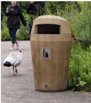
Sherwood™ Litter Bin