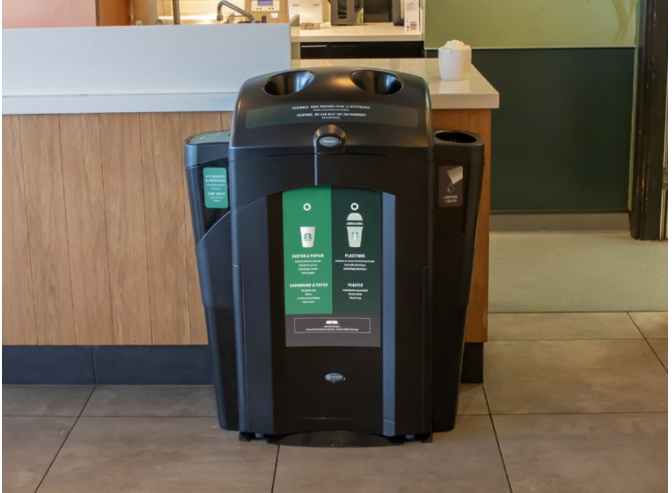
Nexus® 100 Duo Recycling Station

The Glasdon cup recycling bin range has been designed to help you implement an efficient cup recycling programme and increase your cup recycling rates. Choose from our selection of specifically designed cup bins and cup recycling stations which feature liquid reservoirs and separate compartments for cups and lids.