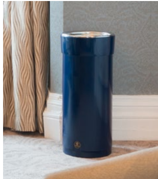
Senior Ambassador™ Litter Bin