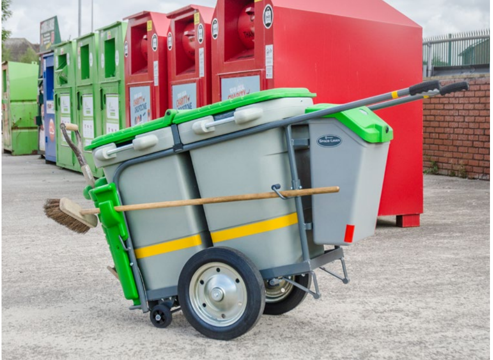
Space-Liner™ Orderly Barrow (Double Model)

Collect, segregate and transport waste quickly and efficiently with multi-purpose street cleaning barrows and litter picking tools. We produce a range of litter collection tools ideal for keeping your environment litter free. Our Orderly Barrows can be used for litter collection and segregation of waste or for transporting equipment.