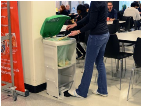
Nexus® Shuttle Food Waste Bin