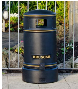
Topsy Jubilee™ Litter Bin