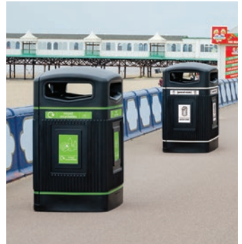
Glasdon Jubilee™ 240 Wheelie Bin Housing