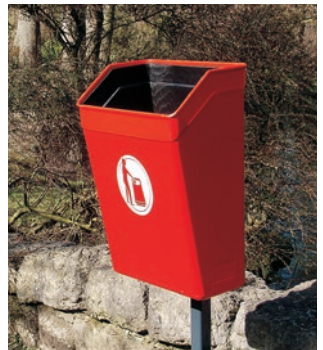
Trimline 25™ Litter Bin