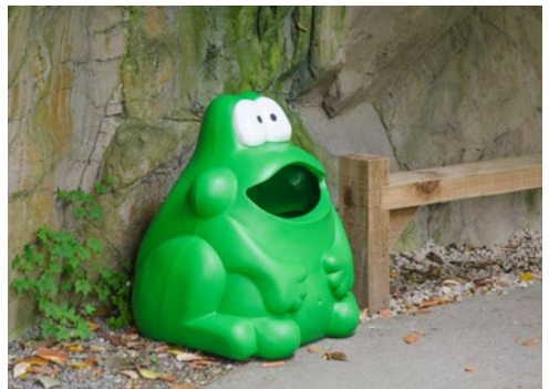
Froggo™ Litter Bin