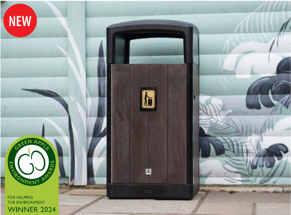
NEW Origin™ Curve 110 Litter Bin

We recognise that waste management requirements may completely differ from one organisation or setting to another. That's why we supply a variety of litter bins that will suit all styles, budgets and requirements. All of our litter bins are easy to clean and never need painting, giving you an attractive and highly functional waste container for many years.