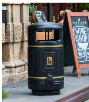
Topsy Royale™ Litter Bin