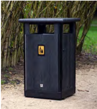
NEW Origin™ Horizon 110 Litter Bin