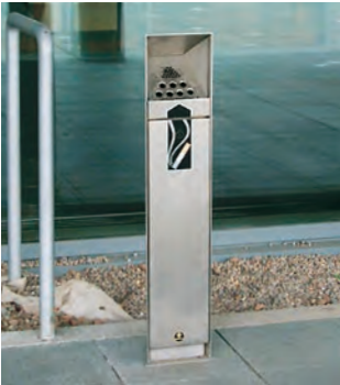
Ashguard™ Cigarette Bin