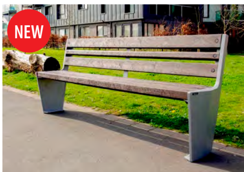
NEW Vistra™ Seat

Visit our website for wheelchair access picnic tables