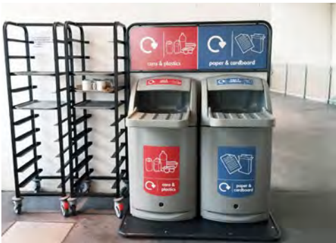
Combo™ Tray Shelf Catering Waste Bin