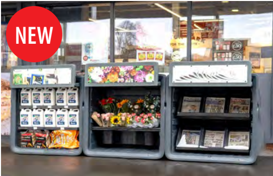
NEW Nova™ Storage Bunker