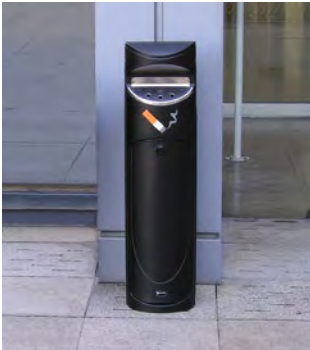
Ashguard SG™ Cigarette Bin