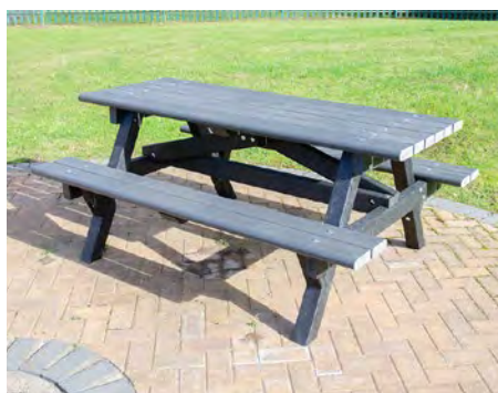
Clifton™ Picnic Table