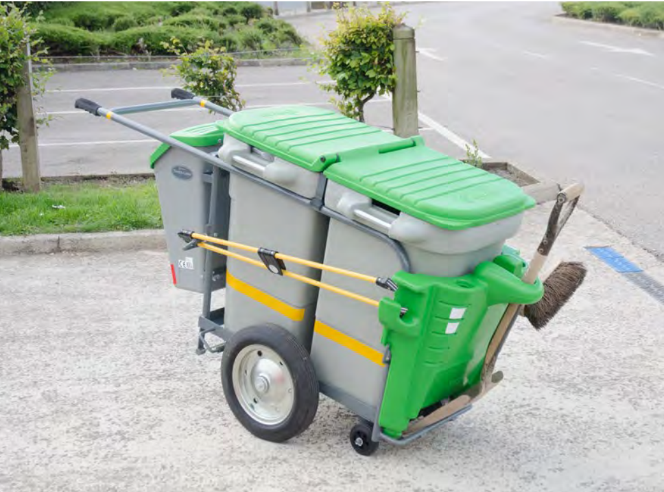
Space-Liner™ Orderly Barrow (Double Model)

Collect, segregate and transport waste quickly and efficiently with multi-purpose street cleaning barrows and litter picking tools. We produce a range of litter collection tools ideal for keeping your environment litter free. Our Orderly Barrows can be used for litter collection and segregation of waste or for transporting equipment.