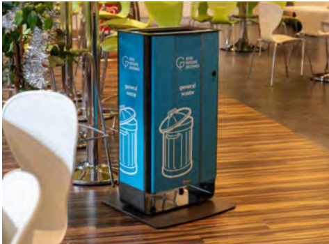
Electra™ 60 Recycling Bin