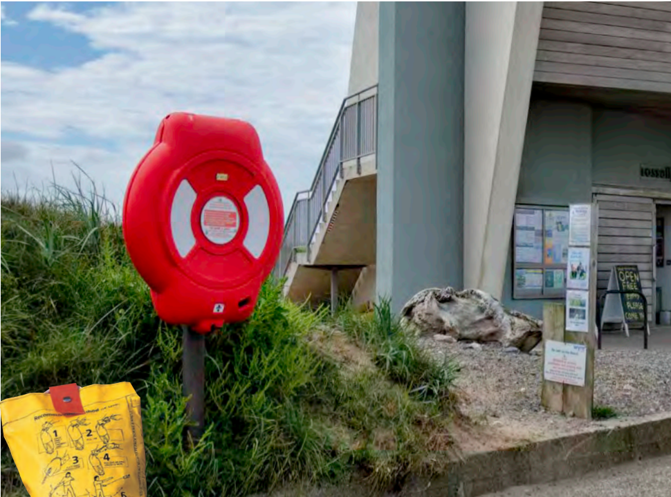
Guardian™ Lifebuoy Housing

Glasdon is a market leader in the manufacture and supply of life-saving water safety equipment. The range includes 24" and 30" lifebuoys with 30m and 50m throwing ropes, lifebuoy housing units, the B-Line™ throw line rescue buoy, and equipment storage units.