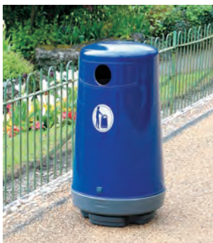
Topsy 2000™ Litter Bin