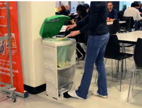
Nexus® Shuttle Food Waste Bin