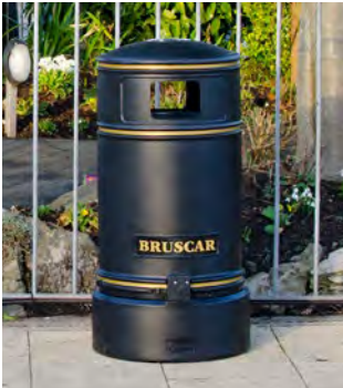
Topsy Jubilee™ Litter Bin