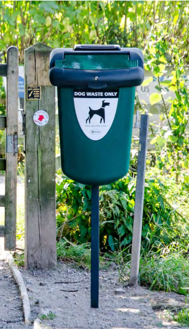
Retriever 35™ Dog Waste Bin

To help keep pavements and open spaces clear of dog fouling, we produce a range of dog waste bins that are extremely strong and durable. Designed to be wall- or post-mounted, these dog waste bins will encourage owners to tidy up after their dogs, keeping areas clean and tidy.