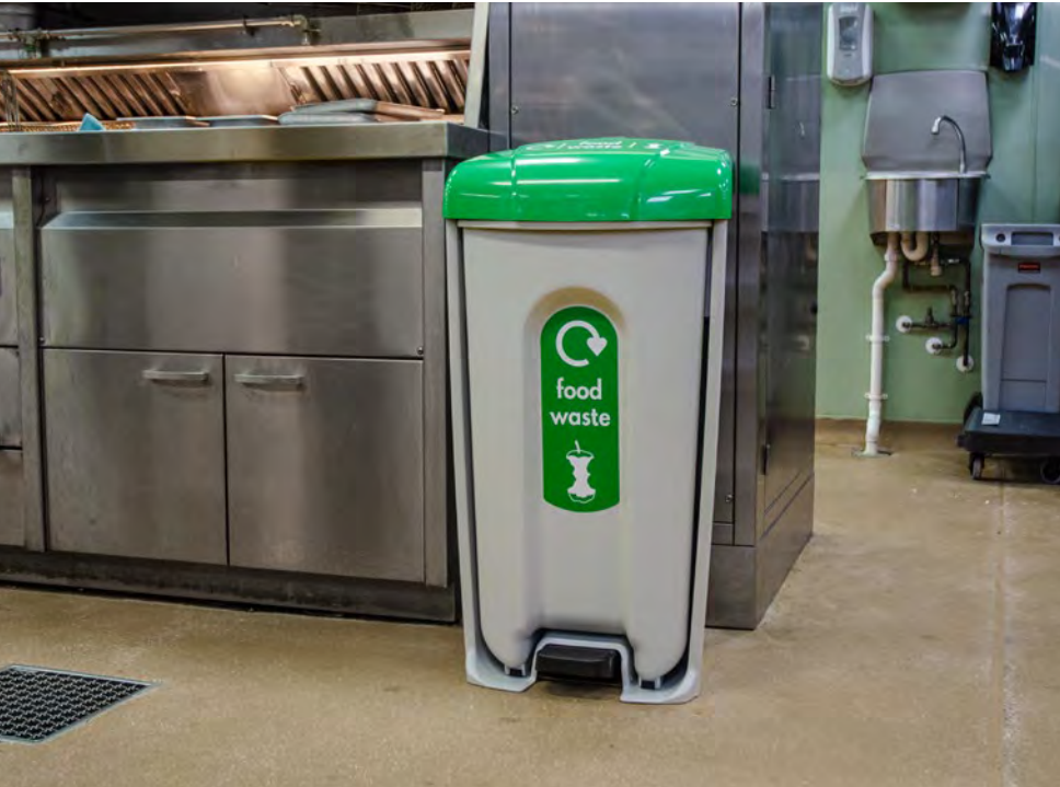
Nexus® Shuttle Food Waste Bin

Our food waste recycling bins are ideal for kitchens, canteens, food courts and any other areas where food is prepared or consumed. The easy to use foot pedals and large apertures make food waste disposal effortless and hygienic.