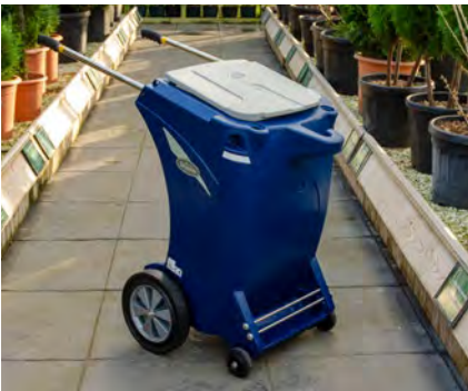
Skipper™ Multi-Purpose Cleaning Trolley