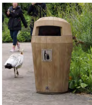
Sherwood™ Litter Bin