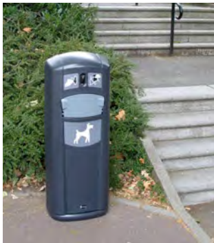
Retriever City™ Dog Waste Bin