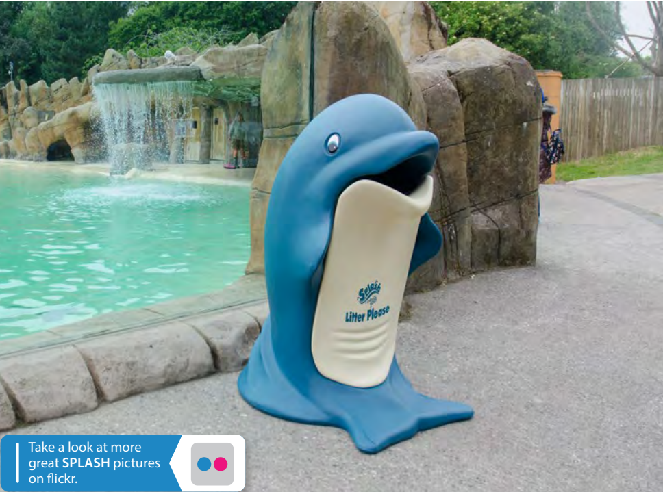
Splash™ Litter Bin

We produce a range of novelty bins, ideally suited for both indoor and outdoor spaces. The bright use of colours and interaction encourage and educate children about the importance of collecting waste.