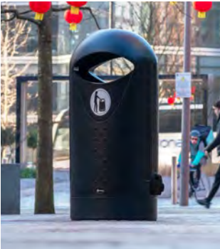
Elipsa™ Litter Bin