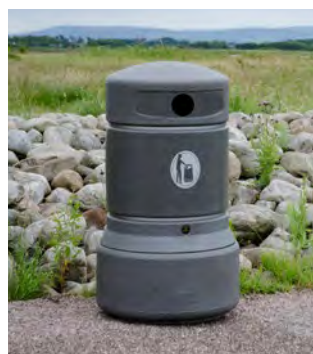
Plaza™ Litter Bin