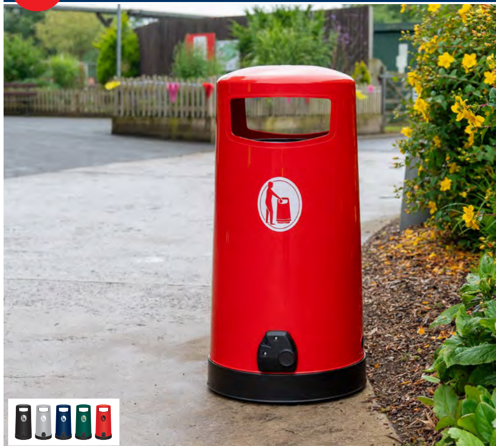
NEW Topsy™ 65 Litter Bin