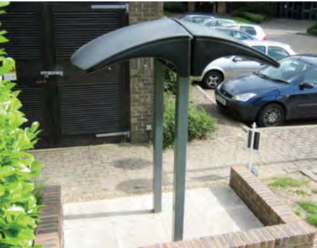
Eclipse™ Back-to-Back Canopy