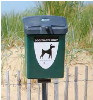
Fido 25™ Dog Waste Bin