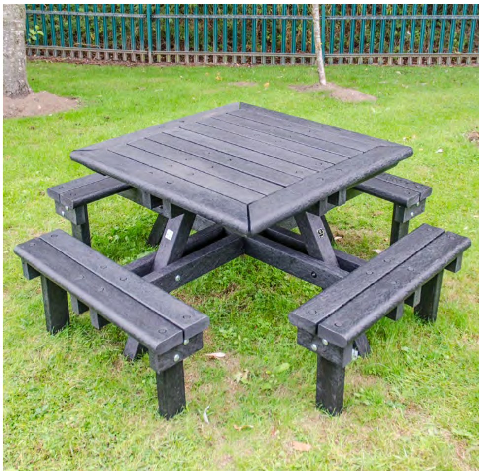
Pembridge™ Picnic Table