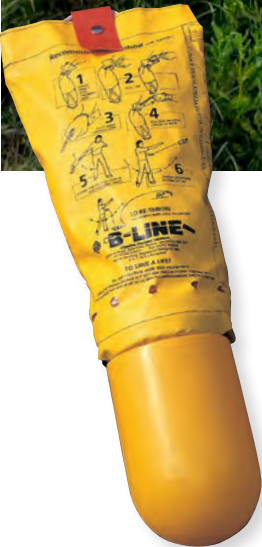
B-Line™ Water Rescue Device