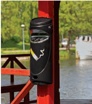
Ashmount SG™ Cigarette Bin