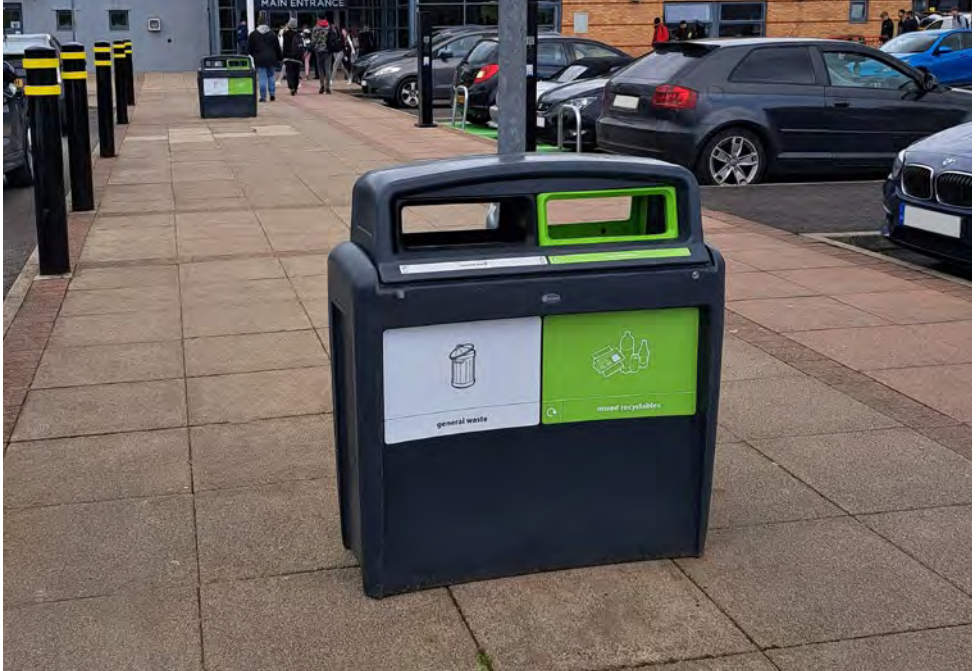
Nexus® Evolution City Duo Recycling Bin

We produce an extensive range of outdoor recycling bins of the highest quality in both traditional and contemporary designs. All of our recycling containers are designed to be hard-wearing and long-lasting and feature easily identifiable graphics to make recycling easy.