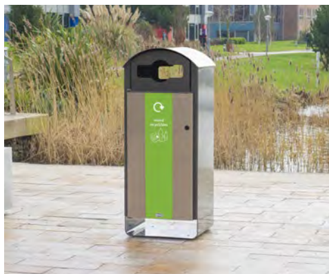
Electra™ Curve 85 Recycling Bin