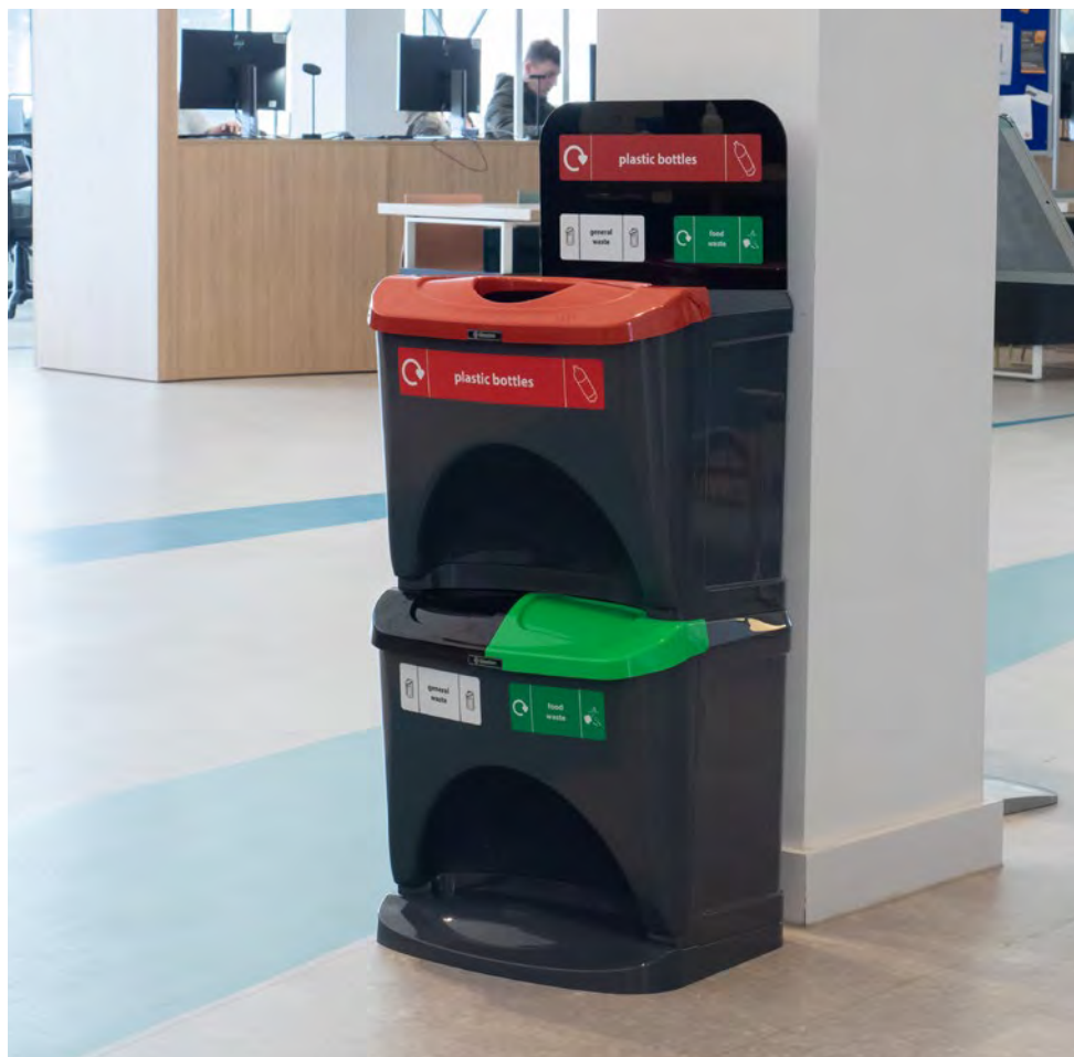
Nexus® Stack Recycling Bins