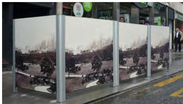
Visage™ Screen System