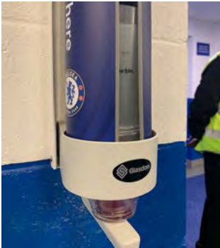
Nexus® Cup Stacker