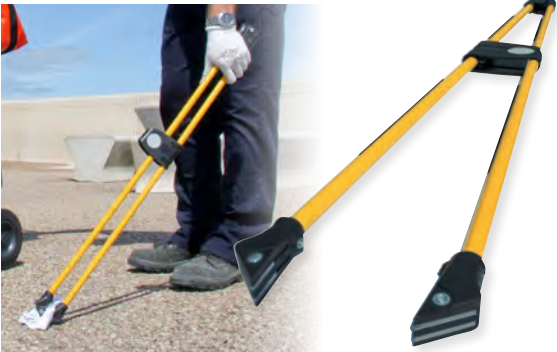
Litta-Pikka™ Collection Tool