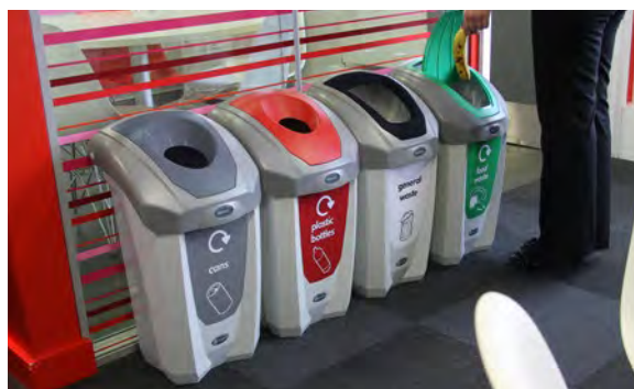
Nexus® 30 Recycling Bin