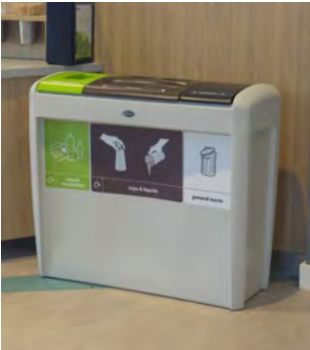
Nexus® Evolution Cup Recycling Station