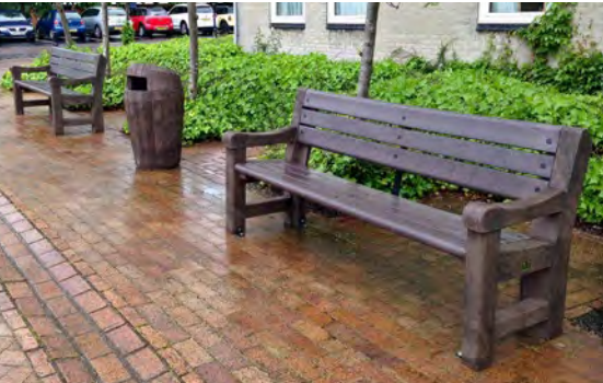
Elwood™ Seat and Sherwood™ Hooded Litter Bin