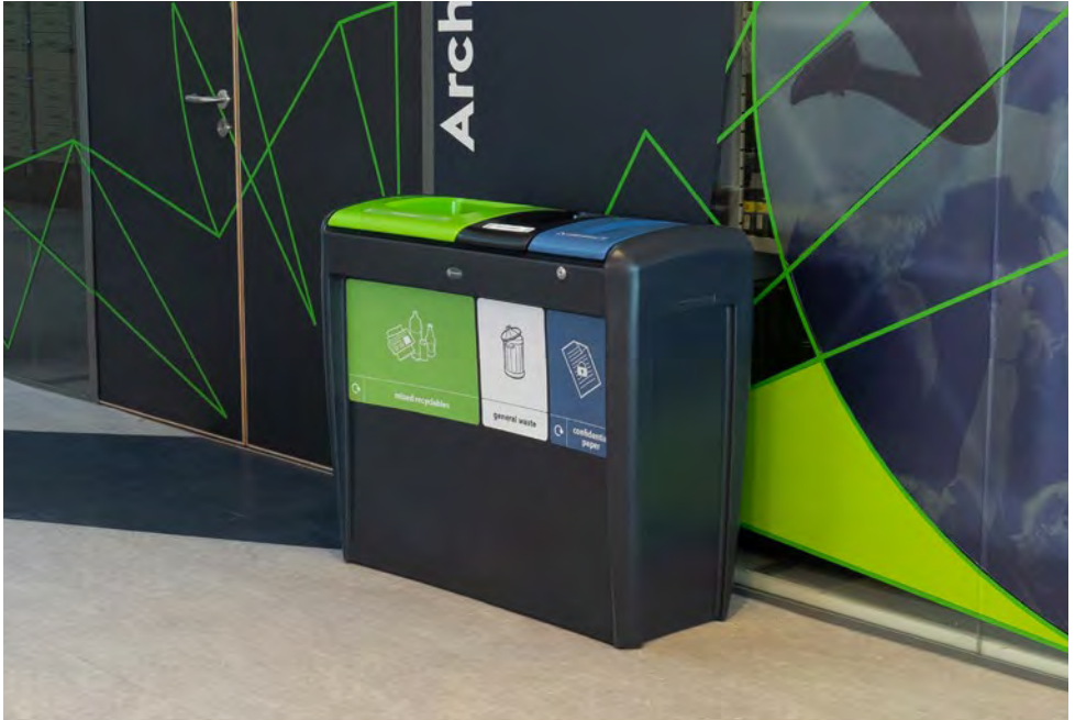
Nexus® Evolution Trio Recycling Bin

Apertures and graphics are available for various waste streams, allowing you to manage recycling waste more effectively.