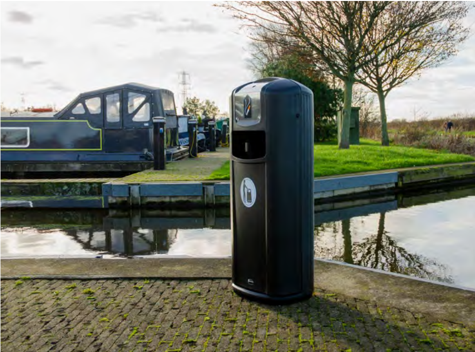
Integro City™ Cigarette & Litter Bin

We're here to help you keep cigarette waste under control on your premises with a wide range of quality, hard-wearing smoking bins. The Glasdon collection offers everything from free-standing ashtrays and cigarette bins to wall-mounted ashtrays.