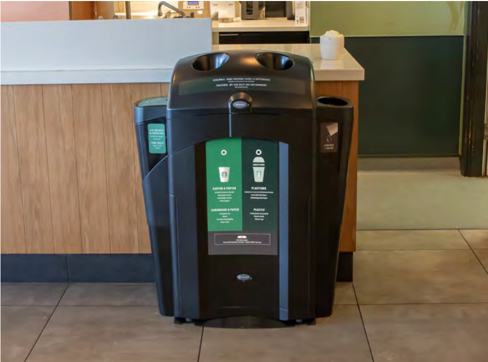
Nexus® 100 Duo Recycling Station

The Glasdon cup recycling bin range has been designed to help you implement an efficient cup recycling programme and increase your cup recycling rates. Choose from our selection of specifically designed cup bins and cup recycling stations which feature liquid reservoirs and separate compartments for cups and lids.