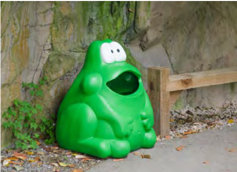
Froggo™ Litter Bin