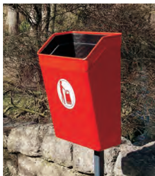
Trimline 25™ Litter Bin