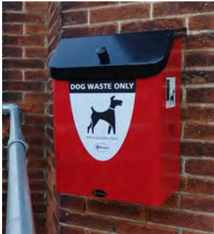
Metal Fido 35™ Dog Waste Bin