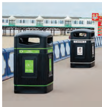
Glasdon Jubilee™ 240 Wheelie Bin Housing