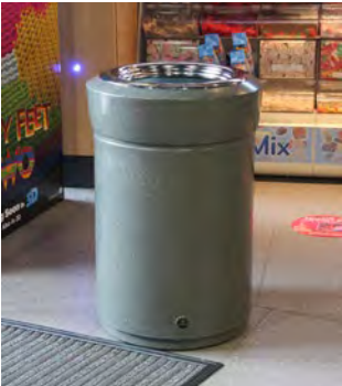
Statesman™ Litter Bin