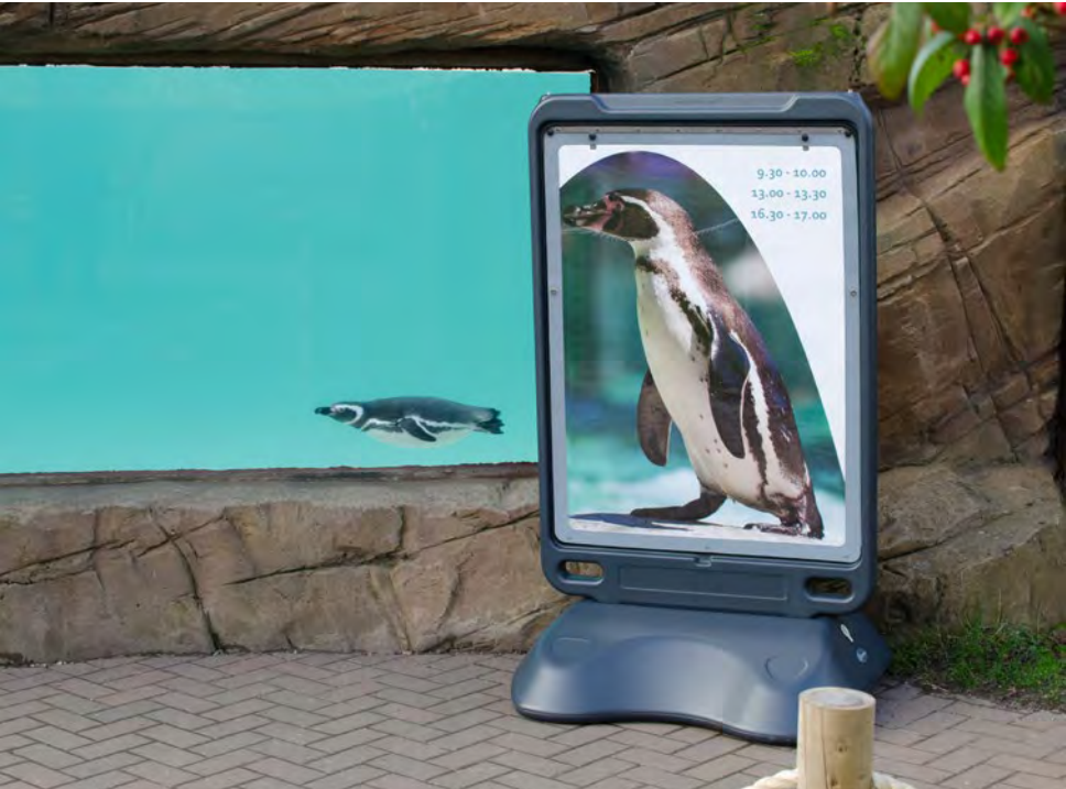
Advocate™ Poster Display Sign

Great for leisure facilities, these site sign carriers and storage bunkers are the ideal way to promote your brand. The Everwood™ material of Glasdon Gateway will not warp or rust and the poster display sign can be easily cleaned. The Nova™ Storage Bunker is designed to offer a large storage capacity and customisable shelving, providing optimal display space.