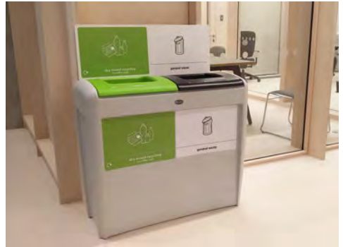
Nexus® Evolution Duo Recycling Bin