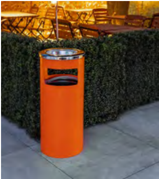
Tweed™ Litter Bin