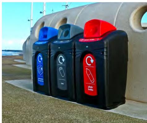
Nexus® City 240 Recycling Bin