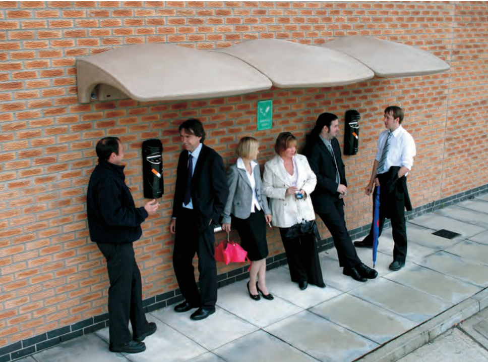
Eclipse™ Wall-Mounted Canopy

Glasdon have over 30 years' experience in the manufacturing of prefabricated canopies, shelters and commercial bike storage facilities.