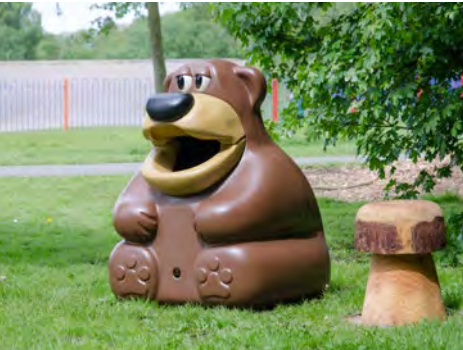
TidyBear™ Litter Bin