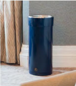
Senior Ambassador™ Litter Bin