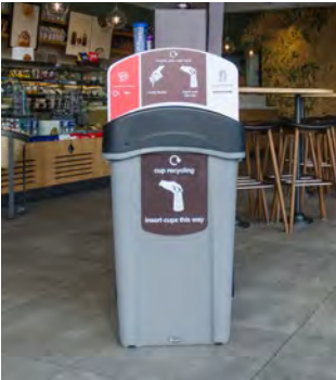
Eco Nexus® Cup Recycling Station