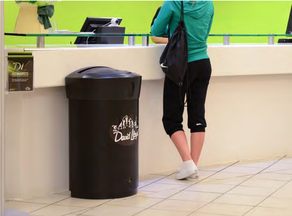
Envoy™ Litter Bin

We produce an extensive range of indoor litter bins made from highly durable materials to ensure a functional and long service life. Our collection of contemporary internal litter bins are stylish and will complement their surroundings.