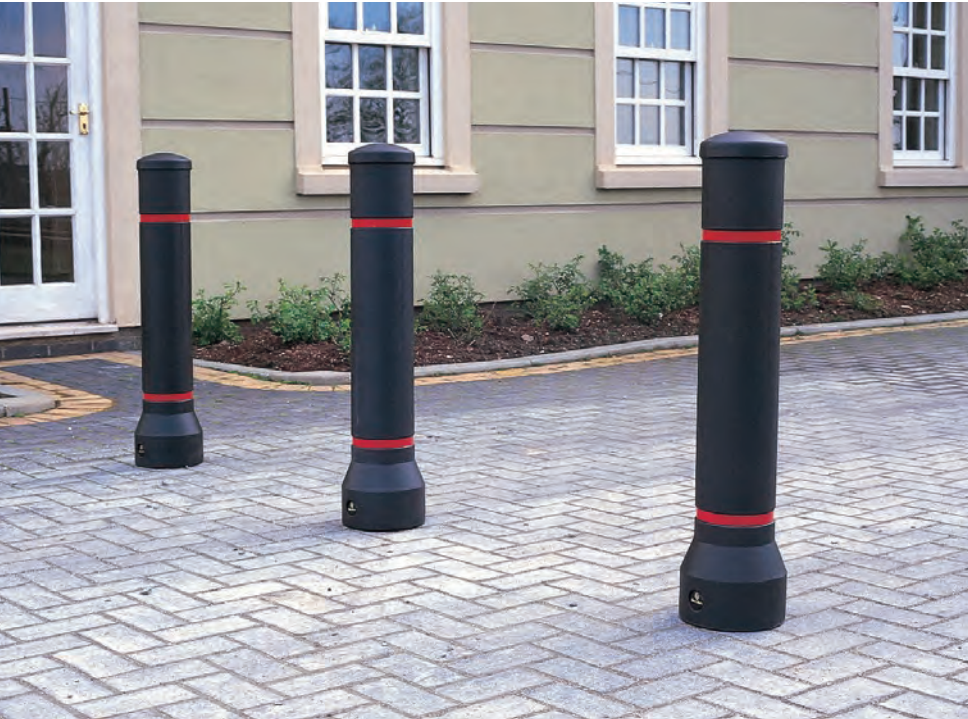
Neopolitan™ 20 Bollard

Our Bollards and Posts are available in a variety of traditional or modern styles and can be used for access control, verge protection and delineators to identify parking restrictions.