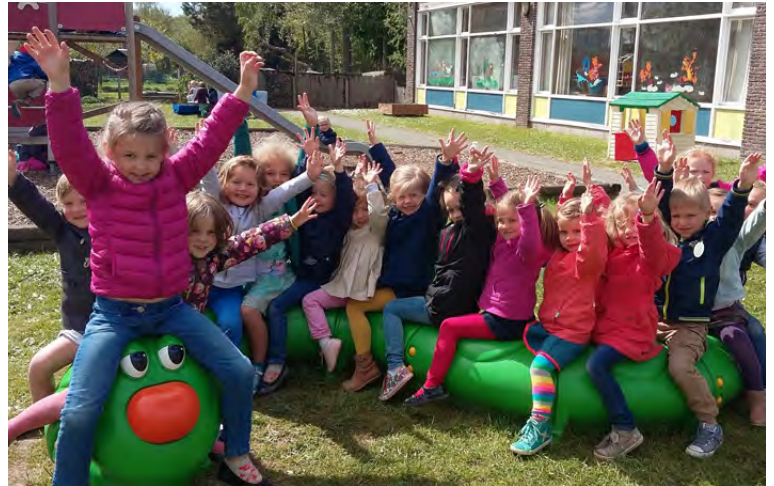
1. Munchy™ The Caterpillar Seat

We offer a range of traditional and contemporary seating that are low maintenance, weather and vandal resistant. They will add comfort and style around your school grounds.