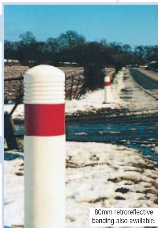
80mm retroreflective banding also available.