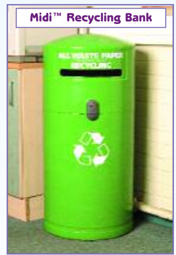
Junior Ambassador Bins personalised to indicate usage.